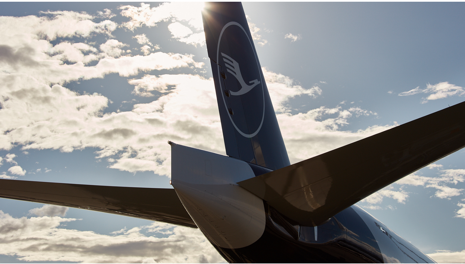
A Boeing 777F of Lufthansa Cargo at Frankfurt Airport